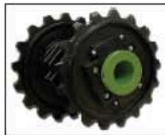
Drive / Idler Sprockets