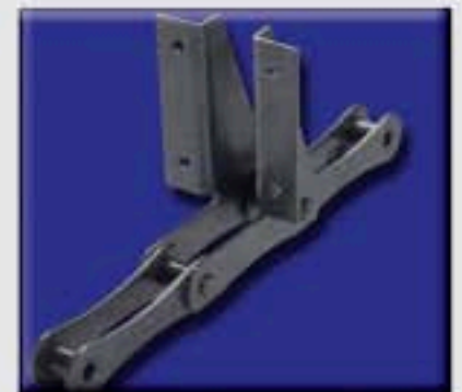
Hitachi SAV 709 SS Chain