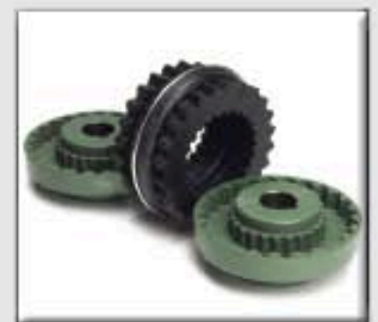
TB Woods Sure-Flex Couplings