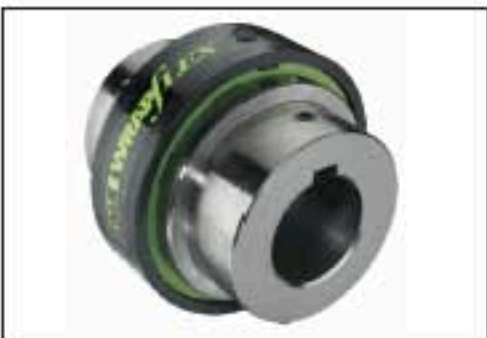
Falk Wrapflex Couplings