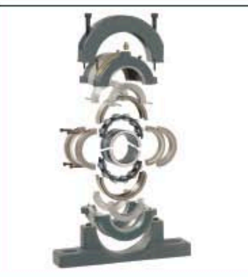
Cooper Split Bearings