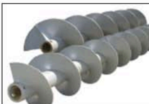
Martin Gear Screw Conveyor