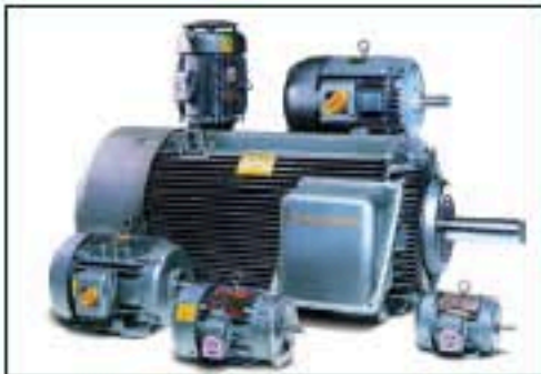
Baldor Electric Motors Extreme Duty

BDI is committed to supporting your operations with local inventories specific to the Wastewater Treatment industry. Each BDI location has technical resources available for on-site troubleshooting and equipment upgrade recommendations.