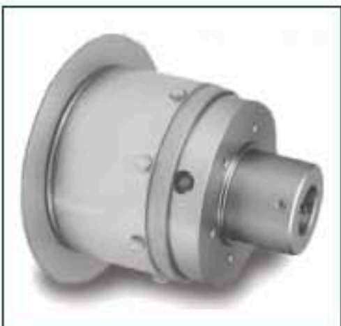
Boston Gear Overload Clutch