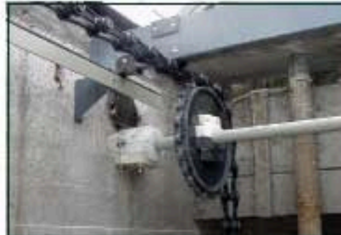
Hitachi Chain and Accessories