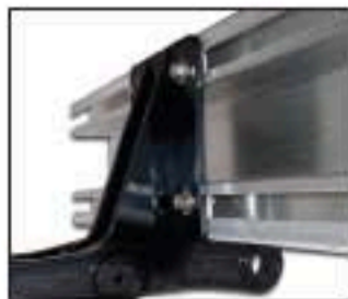
Chain & Flights